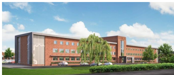
Joseph Banks Laboratories, please follow the car park behind this building

Please take care and drive very slowly in front of the JBL building shown below (particularly in front of the reception area). This is due to the ground having sharp drainage dips at the bottom of the slopes.